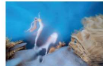
Chang_AB7441 (image created with a dancer from Luminario Ballet)