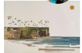
Emrani's landscape piece 'Crescent'